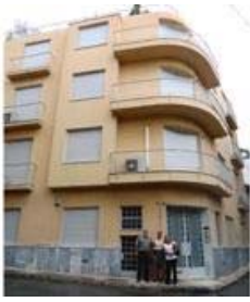
The new church house

The Scandinavian Church, which until recently was situated in Piraeus, relocated to Plaka on 7 February to a house at Daidalou Street 18. There, the church houses a library, office and common room for the congregation and guests. The sermons will be taking place in some of the nearby churches.