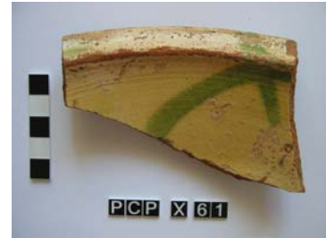
Fragment of 19 th century glazed ware plate from Argyraki cave near Milies

Since 2006, our small project team has been engaged in documenting the human use of approximately 150 caves and rockshelter sites on the mountain. These include vast coastal caves, inaccessible rockshelters in narrow gorges, and abandoned mines dating back to the Roman period. More than 1000 finds have been collected from 50 of the 150 caves (two thirds of the caves yielded no portable artefactual remains) and comprise a wide range of artefacts from the prehistoric, historical and modern periods.