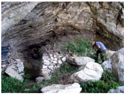
Documentation of graffiti in front of Tsounaga cave near Xourichti

The aim of the project is to explore the uses of space in and around caves and to identify and explain changes and continuity in primarily modern period cave use. Some of the questions we ask are: how are pastoral and other activities organised in and immediately around caves? When and why were caves modified, used, reused, or abandoned? What are the economic, social, and cognitive meanings of caves in society?